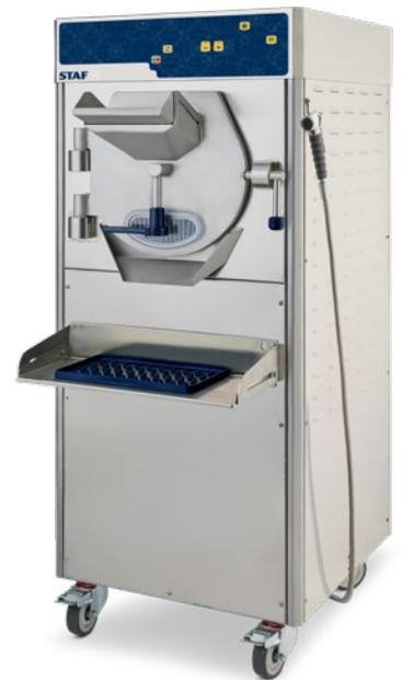
H607M H8011M H10014M