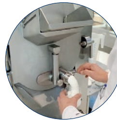
Rubinetto Porzionatore Portioning Tap RH607 RH8011 RH10014