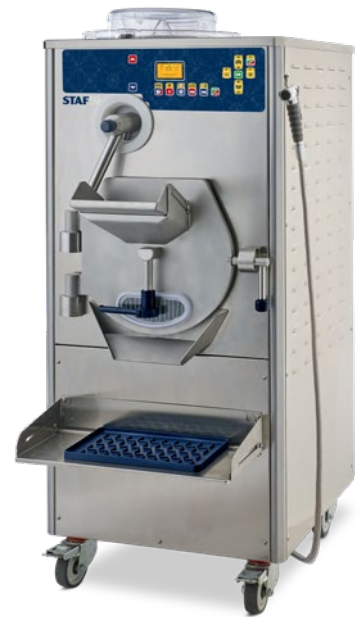
RH607 RH8011 RH10014