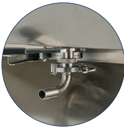
Rubinetto a farfalla pastorizzatore Pasteurizer butterfly tap P40, P60, PT15