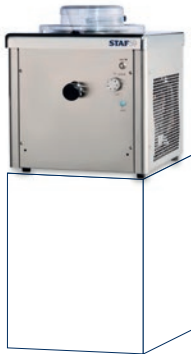
BTM 5 BTM 10